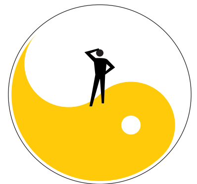
Figure 1: The Convenience Paradox ideogram points to a better way of making choices – by relying on suitably designed information. The more convenient condition is reached by taking the informed choice – and the seemingly less convenient direction (uphill).

The Convenience Paradox shows how polyscopy might be used to broaden the “narrow frame” and undo the damages it has caused to culture.